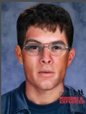
Age Enhanced Photo to age 35